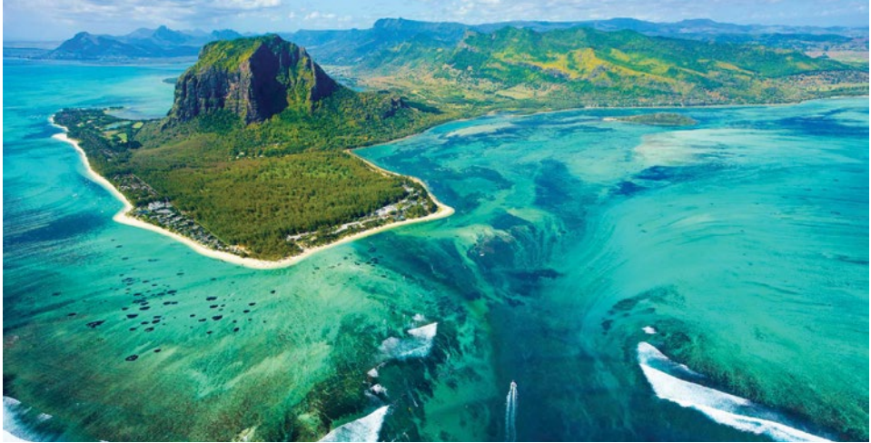
The Island of Mauritius from above

Other exhibitors at stand G25 include: Safari Chapter (DMC), Speke Resort Munyonyo (Accommodation and Conference Facility).