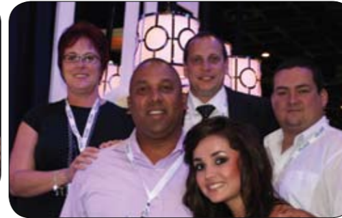
The MTN Expo Centre team with one of the models, front, that hosted guests on the stand.