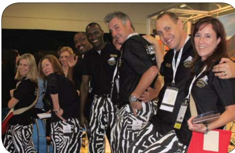
The Legend Lodges, Hotels & Resorts team – all in zebra stripes.