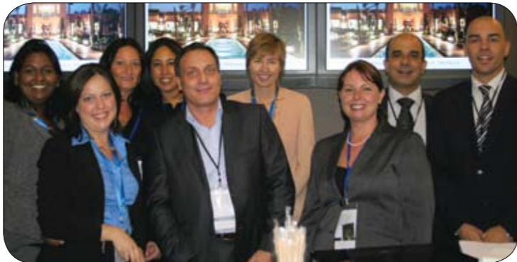
The Arabella Starwood team at Meetings Africa 2011.